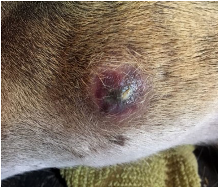
Figure 2. External view of an abscess on the lower jaw of a 5-month-old fawn.

The same bacteria that cause lumpy jaw can cause abscesses in other organs and parts of the body besides the jaw. These infections are quite dangerous because they can lead to sepsis, which is nearly always lethal. The general name for the syndromes caused by these bacteria is “necrobacillosis,” but there are other names as well, usually referencing the part of the body affected by the bacteria. Necrotic stomatitis affects the mouth, hepatic necrobacillosis affects the liver, and foot rot affects the deer's feet. All are syndromes caused by the same organisms that cause lumpy jaw (Gyles et al. 2010). Although confirmation of necrobacillosis can only be performed through proper laboratory identification of the causative agents, in white-tailed deer the presence of lumpy jaw is highly suggestive of this disease (Mainar-Jaime, Woodbury, and Chirino-Trejo 2007).